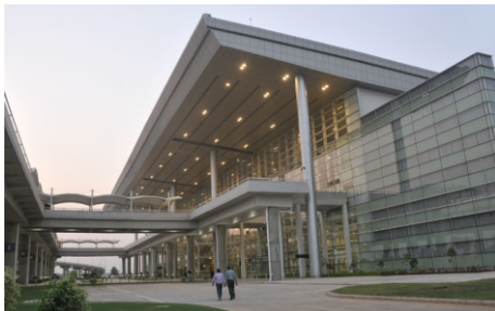
Civil Air Terminal, Chandigarh, Code: IXC Phone: +91172 265 9886

The Avance Dental Care may be the best place to start when searching for free flights. They will connect dental patients to available flight resources. There is no charge for this referral service. Of course, you can also choose to call our Reception Office directly if you like.