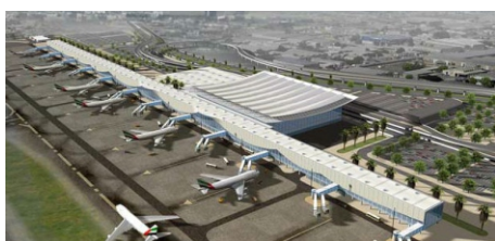
Airport Road, New Delhi Code: DEL Phone: +91124 337 6000

Indira Gandhi International Airport - serves as the primary civilian aviation hub for the National Capital Region of Delhi, India. The airport, spread over an area of 5,106 acres is situated in Palam. It is the busiest airport in the country in terms of passenger traffic since 2009. In 2010 it became India's and South Asia's largest aviation hub, with a current capacity of handling more than 40 million passengers. In 2015, the airport was the 25th busiest airport in the world by passenger traffic and 12 th busiest airports in Asia.