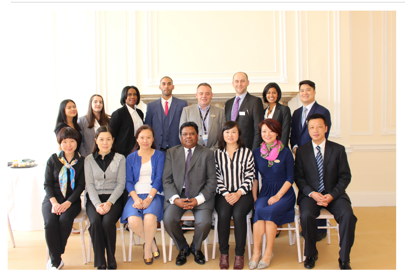
Aier Eye Hospital team at AVC, London

A team of China's leading refractive surgeons from the Aier Eye Hospital Group has made a special visit to Harley Street eye clinic Advanced Vision Care (AVC) to share their exceptional knowledge and experience of Visian Implantable Contact Lens (ICL) surgery.